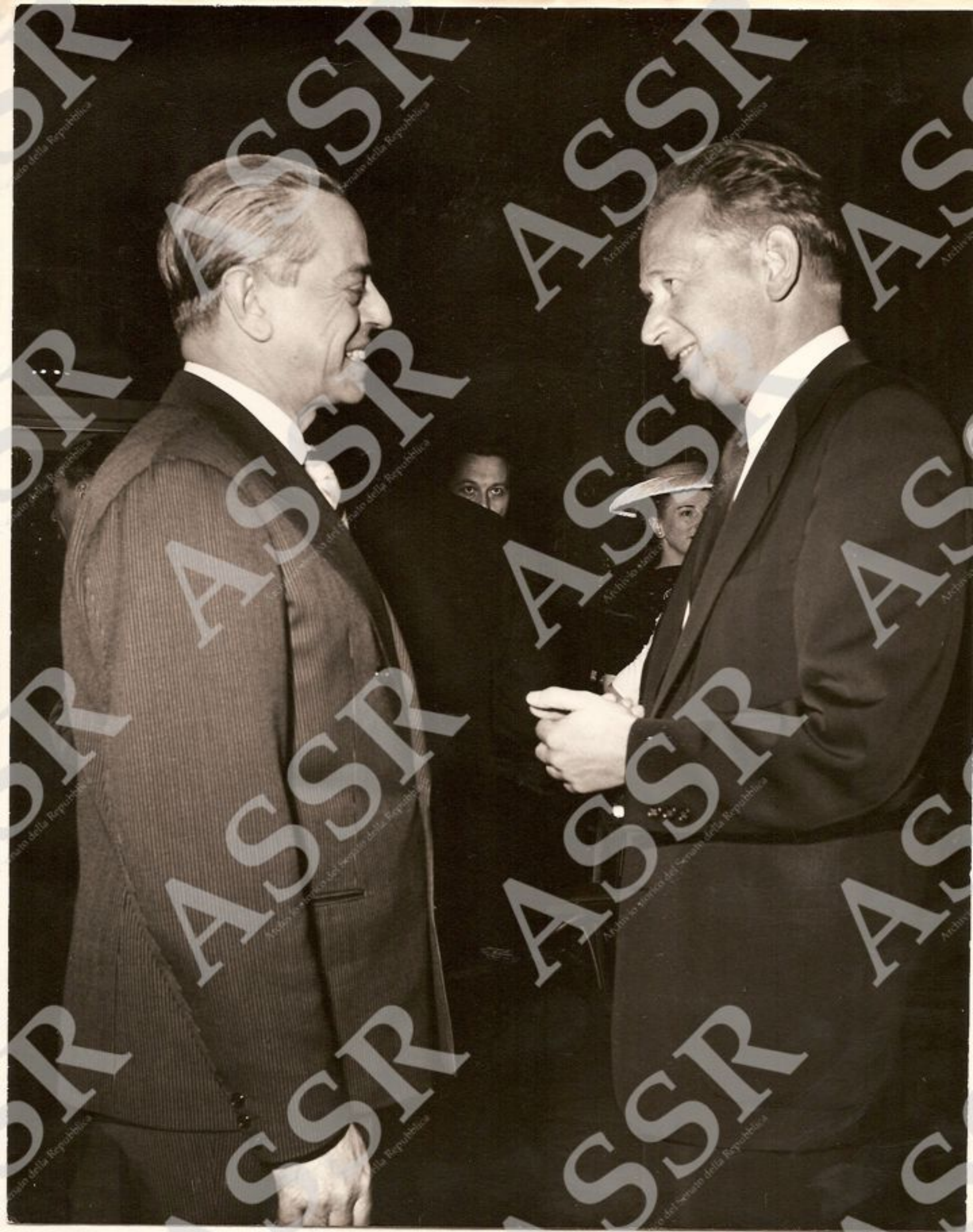
Il Segretario Generale delle N.U.